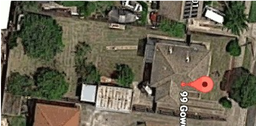
D/63/2017 99 Gower Street PRESTON